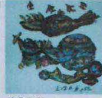
古代文明 33.5cm X 33.5cm 150萬元