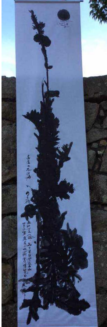
The High Sun