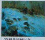
(京都美術館95年 昭和美術國際出品) 秋景 53cm X 38.5cm 520萬元